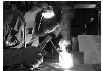
Shielded metal arc welding